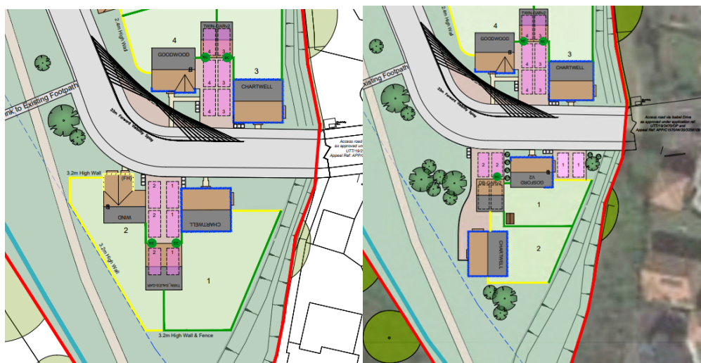
Figure1: Extract taken from original site plan previously presented to Members on 8 th February on the left and the proposed new revised

1.7 To resolve the design and layout concerns, the Applicant has revised the siting and orientation of Plots 1 & 2 as seen in Figure 1 below. In addition, the house types have been slightly amended, but both contain 4 bedrooms as previously, and the proposed boundary treatments have been reduced from 3.2m to 1.8m. Both dwellings would contain in excessive of 100sq.m of private garden areas and provide appropriate off-street parking provision in accordance with the relevant standards.