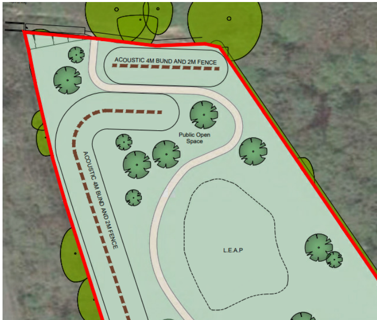
Figure 2: Extract of northern Part of Parcel B showing position of proposed bund.

1.18 These revisions have been checked by the Council's urban design officer and the environmental health officer who has confirmed the details are appropriate from both a design perspective whilst at the same time helping to minimise noise and disturbance to the public open space area.